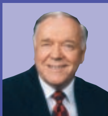
Kenneth E. Hagin

And to know the love of Christ, which passeth knowledge, that ye might be filled with all the fulness of God. — Ephesians 3:19