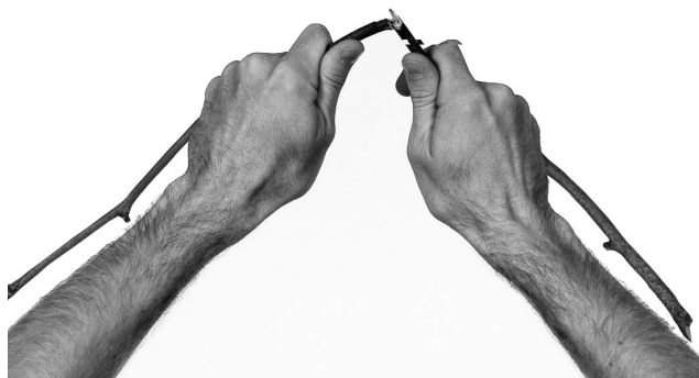
One stick breaks easily under pressure. No one can succeed in this world on his own. We need other people. Even Jesus needed a team of partners.

• Literature: Rev. Kenneth E. Hagin and Rev. Kenneth Hagin Jr. have authored 147 faith-building books. More than 65 million copies of these books are currently in