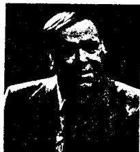
Kenneth E. Hagin

Thursday-Saturday, 10:00am, 2:30pm, & 7:30pm