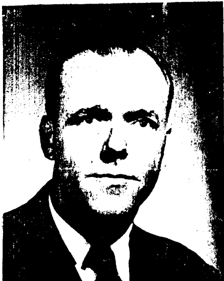
WITH REV. HAGIN ON THE GOSPEL CIRCUIT

PUBLISHED BY KENNETH E. HAGIN EVANGELISTIC ASSOCIATION, P. O. Box 50126, - TULSA, OKLA. 74150 May, 1968 Vol. I No. 2