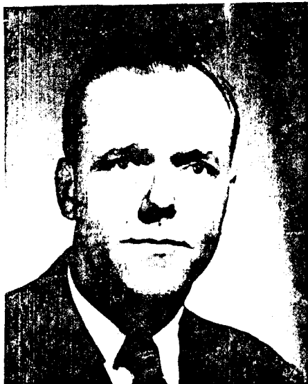
WITH REV. HAGIN ON THE GOSPEL CIRCUIT

Following our Seminar in March, I went to Chattanooga, Tenn. for a Rally Day sponsored by the Chattanooga chapter of the F.G.B.M.F.I. This Rally was held on Friday night and all day Saturday, March 22, 23. Here the Lord met us in a most unusual way and I believe I had the greatest anointing to minister on Saturday night that I have had for many a year.